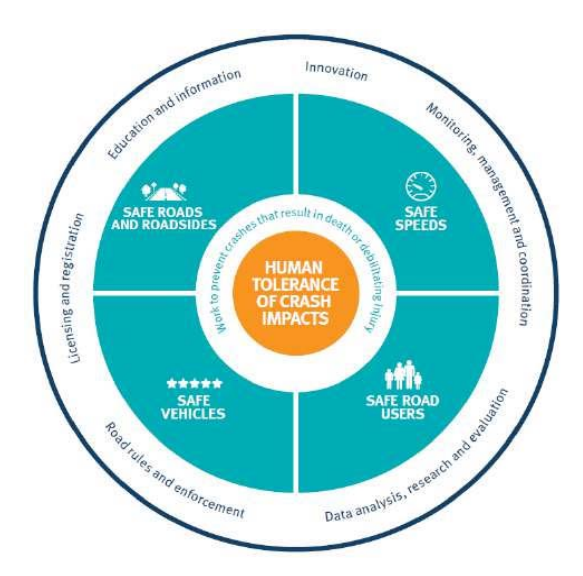
Figure 1. Critical Factors [1]